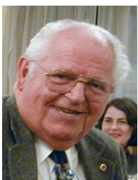
Yes, that's all that happened!